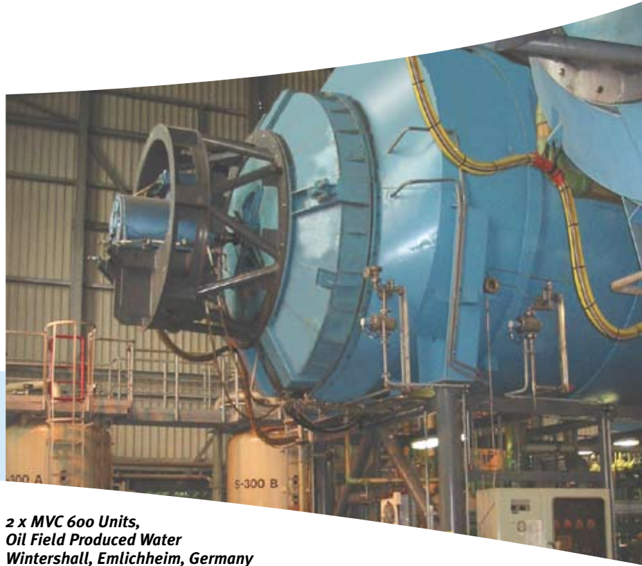
2 x MVC 600 Units, Oil Field Produced Water Wintershall, Emlichheim, Germany