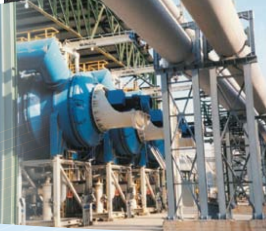
6 x MVC 2,880 Units, Sarlux, Sardinia, Italy