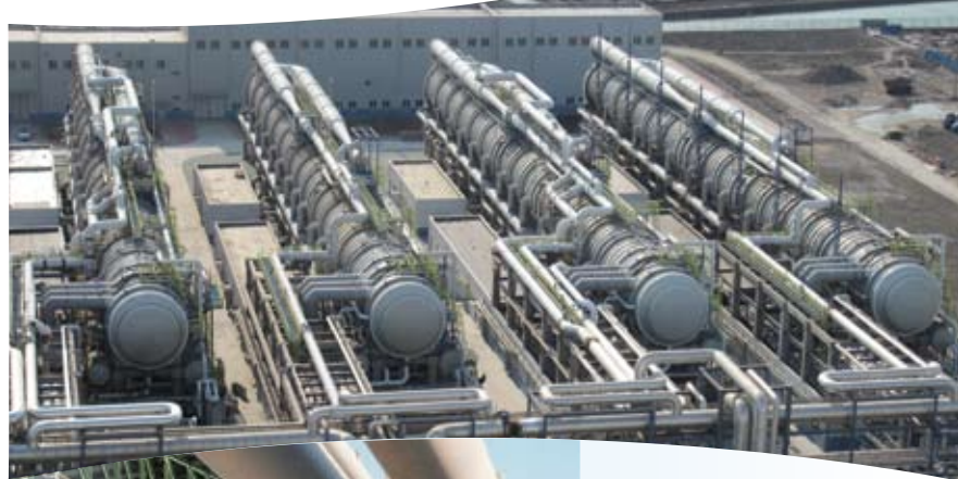
4 x MED 25,000 Units, Tianjin, China

Our customized desalination plants and self-contained desalination units provide high-quality water for use in industries, mines, refineries, and power stations, as well as for potable water applications and agriculture. IDE is jointly owned by two of Israel's largest industrial enterprises: ICL Group (50%), one of the world's leading fertilizer and specialty chemicals companies, and Delek Group (50%), the leading energy & infrastructure group based out of Israel.