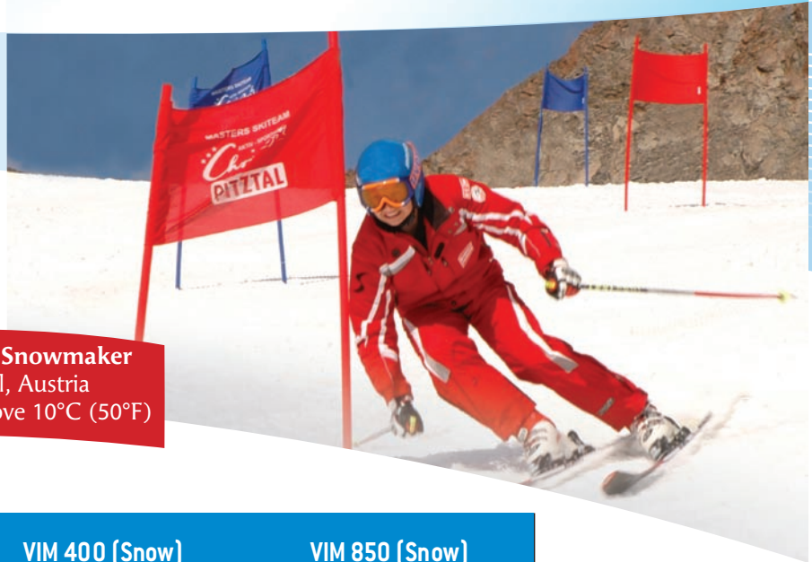
IDE All Weather Snowmaker Slope at Pitztal, Austria Sept. '09, Temp. above 10°C (50°F)