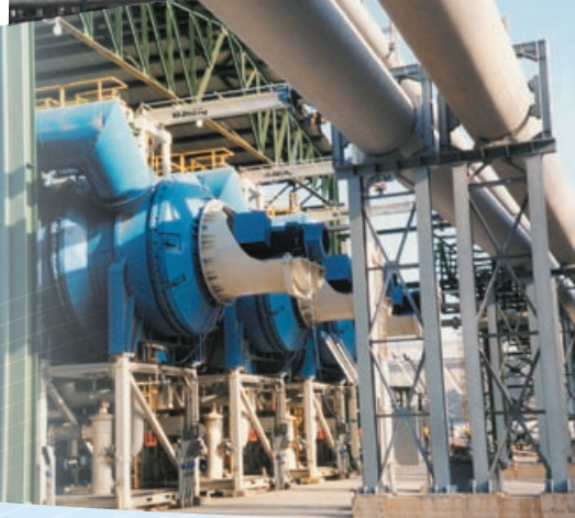
6 x MVC 2,880 Units, Sarlux, Sardinia, Italy