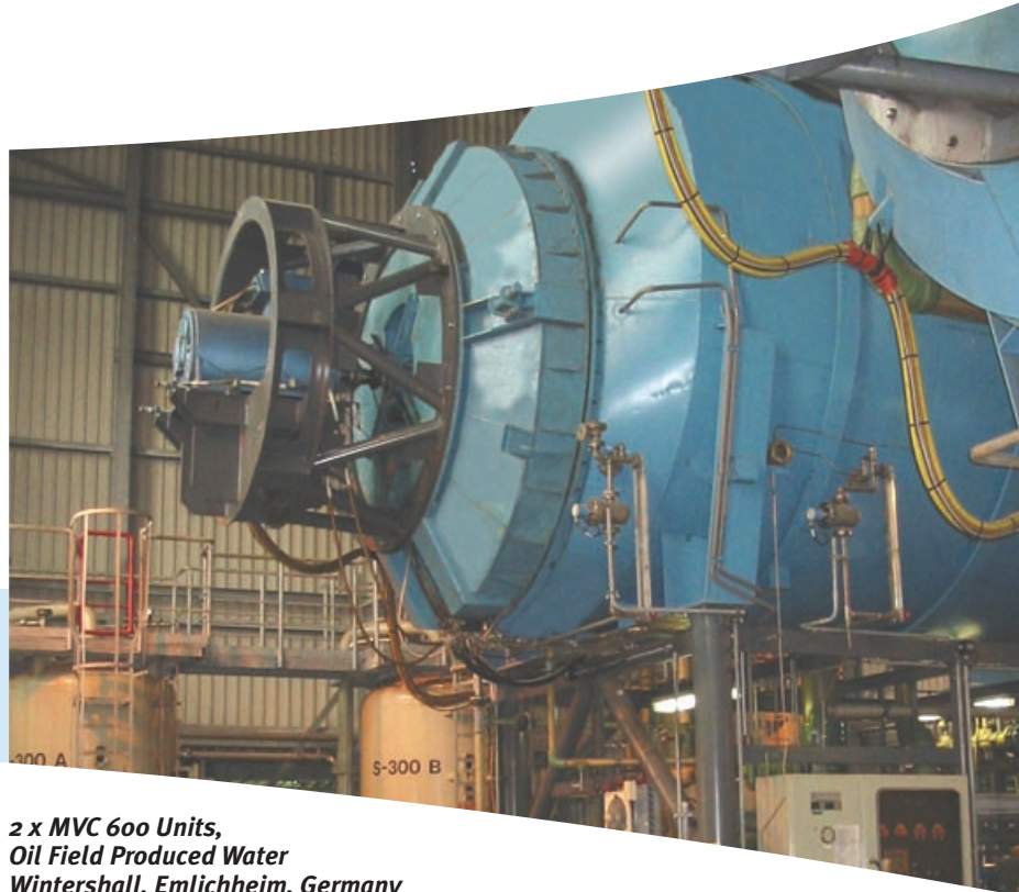
2 x MVC 600 Units, Oil Field Produced Water Wintershall, Emlichheim, Germany