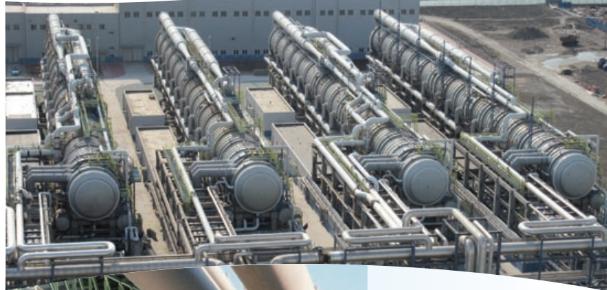
4 x MED 25,000 Units, Tianjin, China

Our customized desalination plants and self-contained desalination units provide high-quality water for use in industries, mines, refineries, and power stations, as well as for potable water applications and agriculture. IDE is jointly owned by two of Israel's largest industrial enterprises: ICL Group (50%), one of the world's leading fertilizer and specialty chemicals companies, and the Delek Group (50%), a leading international energy, real estate and financial services group.